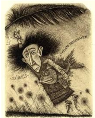
Figure 4

manner of realizing stylized images (Figure 4: Ex libris O. Premstaller . Etching, 1995).