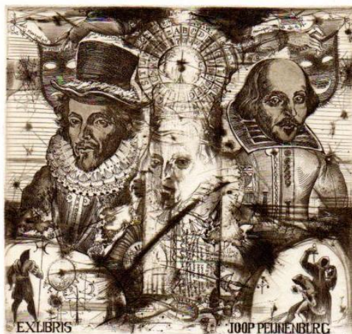
Figure 5 (From personal collection)

In a close stylistic manner, is the creative pattern of S. Ivanov. One of the great artists of Ukraine, S. Ivanov is known as a painter, as well as the creator of easel graphic, book illustration and ex libris . In the field of graphic, his sheets of work are monochrome, using the gradations of tone in a rich palette as a tool of artistic expression (Figure 5: S.Ivanov, Ex libris J. Peijnenburg . Etching, 1994).